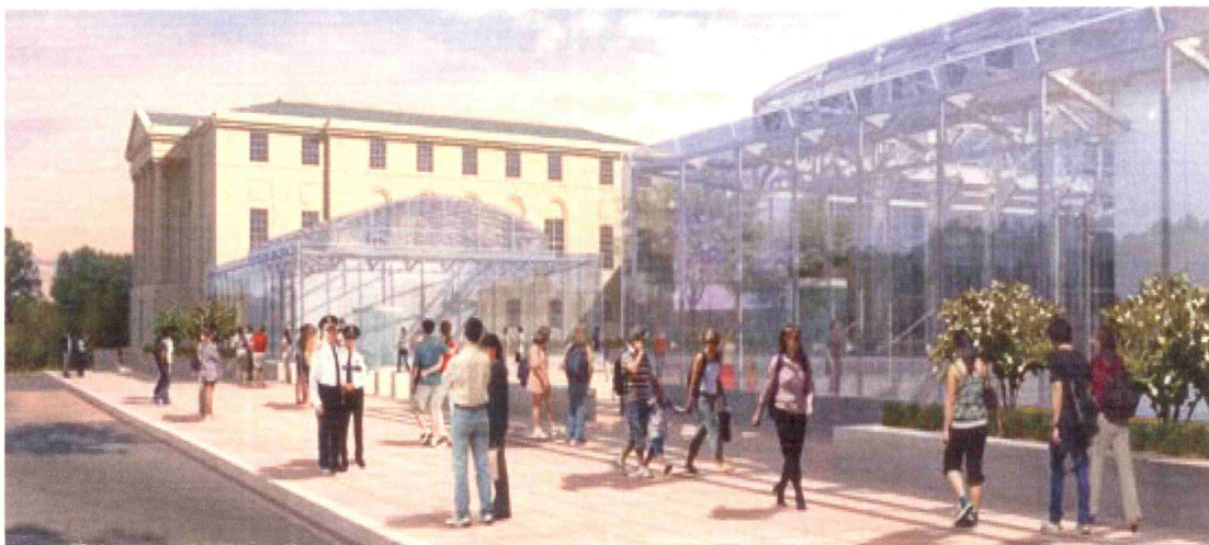
Artist Rendering of National Law Enforcement Museum. Scheduled to open 2013.